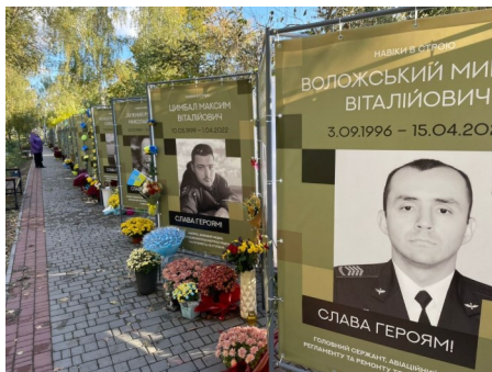
Memorial to fallen soldiers from our town

We then flew to Krakow, Poland, took a train to the Polish/Ukrainian border, and got on a Ukrainian train that took us to Kiev where we visited missionary friends for a couple days. We saw no war damage in the places we were, though there were soldiers, and sandbag piles here and there. We took the train on to our town, Oleksandriya, in central Ukraine. Even less signs of war were visible, though the memorial to the soldiers that had died from our town was the most graphic reminder that the war is real and lives are lost in the fighting.