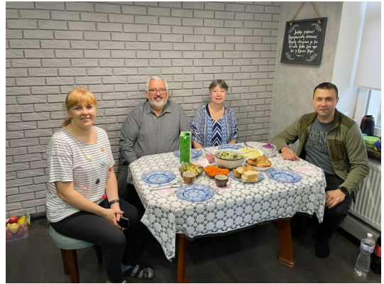
Meal with friends

We were able to sort our stuff in our apartment, packing 6 suitcases to bring back and giving the rest away to friends and refugees that are living in town. We were able to visit all our friends that we'd hoped to see. It was hard to tell them this chapter is over, but we do hope to go back for short periods of time in the future to help with some printing projects. We were so blessed to fellowship 2 Sundays with the church body there. They have some amazing opportunities and outreaches happening all the time.