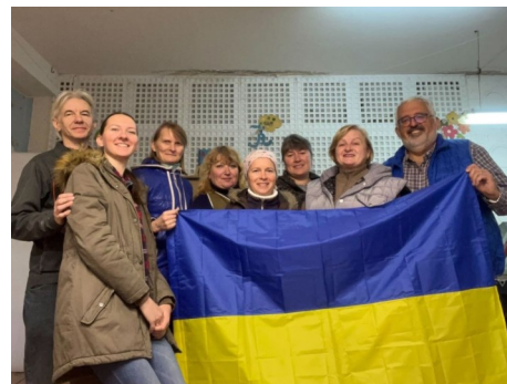
Reconnecting with everyone at Digibooks Press, except the two that are serving in the army.

We did hear the air raid siren alert every day and sometimes at night, which meant missiles were flying somewhere. The locals had an app on their phones that showed where the missiles were detected, so people could know to be better prepared. To us it just felt like old normal times. But then we heard the stories of the beginning of the war, how everyone was so shocked and scared and didn't know what to do. We understood that it was a terrible time, and on the edges of the country it continues as fighting has not stopped. People, especially not near the front lines, have gotten used to life this way. We continue to pray that the war will stop soon. And we pray for the families that have lost loved ones as casualties in the war.