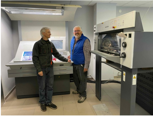
Seeing the press that was installed in our absence