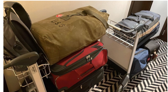
6 bags representing many hours of sorting and packing

Packing and cleaning out our apartment was especially stressful the last few days, but thank you for praying, it all got done. We have a possible buyer for the apartment which a friend will finish for us. Then 3 friends drove us by car back to Krakow, Poland which was easier with all our bags. They also had business to take care of in Poland, so the 15-hour trip, plus 6 hours waiting at the border were worth it for all of us.