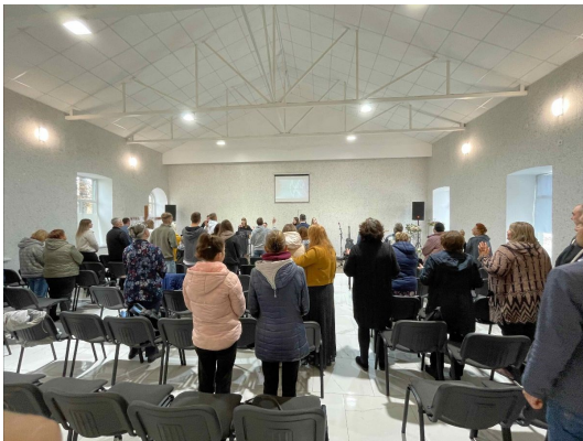
Two special Sundays at church

We were able to sort our stuff in our apartment, packing 6 suitcases to bring back and giving the rest away to friends and refugees that are living in town. We were able to visit all our friends that we'd hoped to see. It was hard to tell them this chapter is over, but we do hope to go back for short periods of time in the future to help with some printing projects. We were so blessed to fellowship 2 Sundays with the church body there. They have some amazing opportunities and outreaches happening all the time.